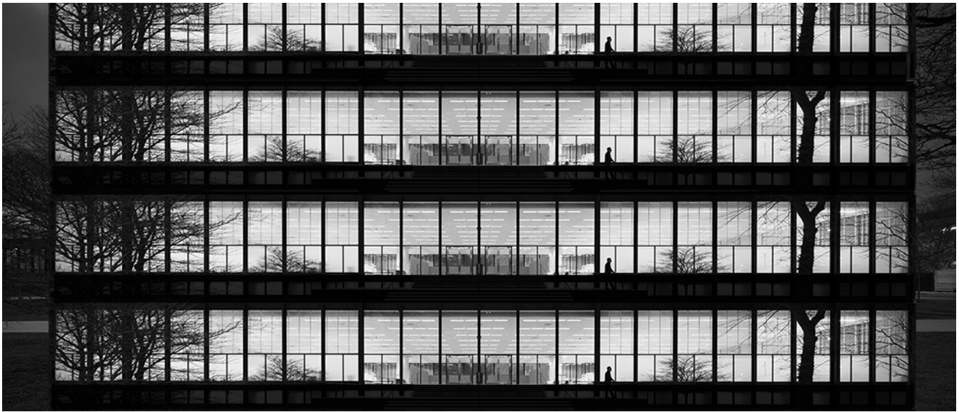
Figure 2. “Slices of horizontality piled vertically” (collage of Crown Hall). Credit: collage by author of photograph by Hagen Stier.

vertically, with distinction only in the conditioning of light, sound, and air.” 27 Formally one can easily imagine the office buildings of the time by Mies, SOM, and others as simply stacks of Mies’ universal space pavilions. Further reinforcing this conception, iconic nighttime photography of these projects by Ezra Stoller and others dramatically emphasized their layered horizontality and openness.