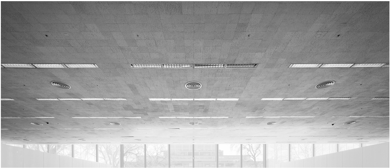
Figure 1. Ceiling plane at Crown Hall, IIT. Credit: collage by author of photograph by Pete Sieger.

suspended ceiling. Eventually “the tyranny of the tile format was to become almost absolute, so that even long-established products had to conform.” 17 The continued standardization of ceiling panel sizes is demonstrated through a survey of current acoustical materials in PA in late 1952. The article summarized the varieties of acoustical ceiling products on the market, with panels standardized in 12” increments (12”, 24”, 48”) while the materials (cellulose-fiber, mineral wool, fiberglass, asbestos, metal, and cork) and installation methods (direct attach, furring strips, and suspension systems) still varied considerably. 18